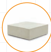
Grid Cocktail Table