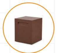
Tank Stool/Side Table