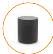
Station Stool/Side Table